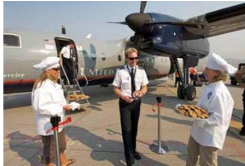
Cookies were handed out to surprised passengers aboard the first flight back into the new and improved Eagle County Regional Airport earlier this week after a summer-long closure to lengthen the runway. The longer runway will allow for planes with more passengers in the summer and perhaps more international flights in the winter.

Realists in mountain communities say a much more likely scenario than Denver to the Eagle County Regional Airport (the actual line studied by the Rail Authority) is an Eagle to Leadville