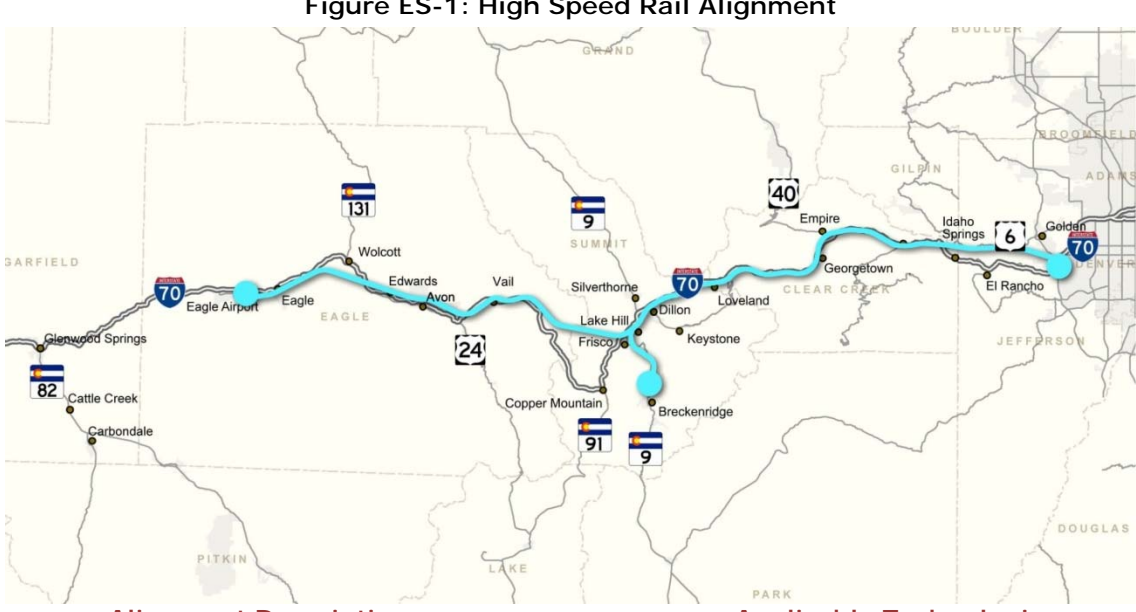
Figure ES-1: High Speed Rail Alignment