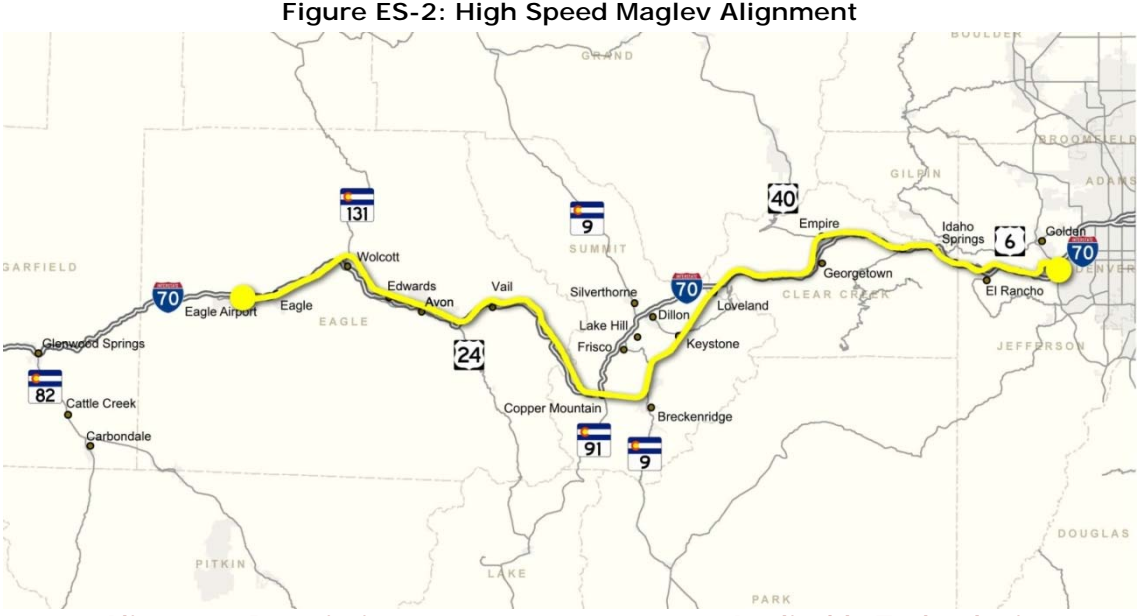
Figure ES-2: High Speed Maglev Alignment